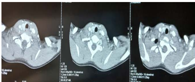
Figure 3: The cervical CT-Scan confirming the agenesis of the left thyroid lobe with a normal aspect of the right lobe and the isthmus.