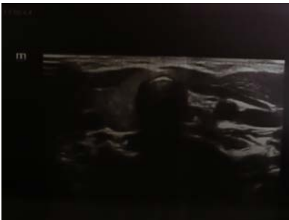
Figure 2: Cervical ultrasonography revealing the agenesis of the left thyroid lobe.