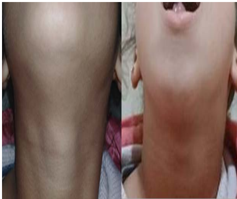
Figure 1: Clinical examination revealing an anterior cervical mass mobile with tongue propulsion.

which ruled out the presence of an ectopic thyroid gland. TSH level was normal. The patient underwent a modified Sistrunk procedure with resection of the median portion of the hyoid bone without resection of a portion of the musculature of the base of the tongue. Post-operative period was uneventful and the patient was discharged on the second post-operative day ( Figure 4 ).